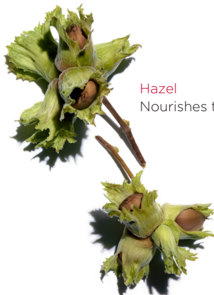
Hazel Nourishes the skin

Clarins, the Body Care specialist, offers a specific solution to every beauty concern. Thanks to high-performing formulas concentrated in plant extracts and to Clarins expert touch, you'll experience a made-to-measure treatment with proven efficacy 1 .